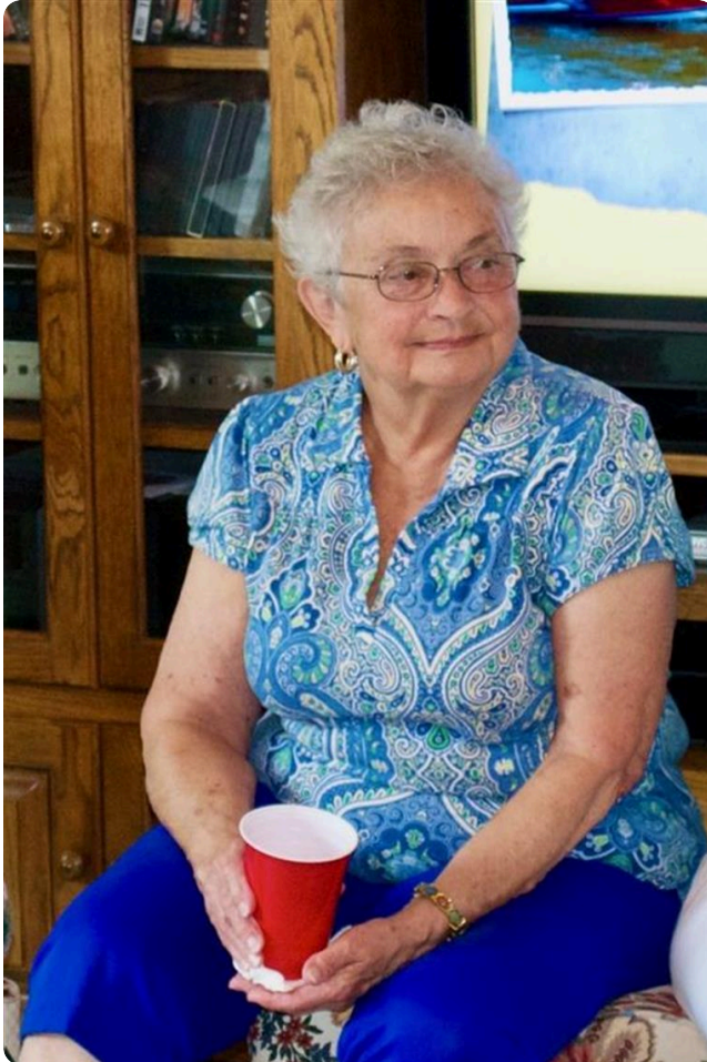
Family reunion in Merrill.